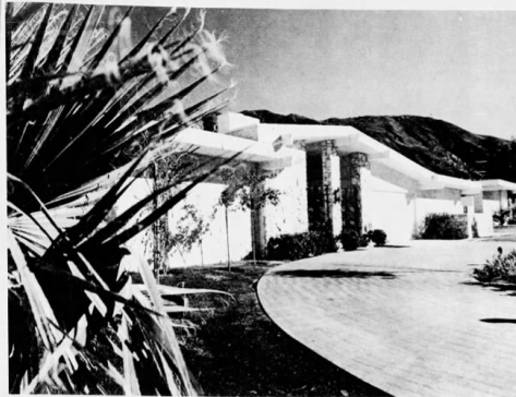
TYPICAL SCENE — Homes in the Roy Fey Canyon Estates have mountain backdrops plus desert plantings — the best of "two worlds."

When you hire a designer, you are hiring a professional. You are hiring a professional who will work with you to create a home that is both functional and beautiful. You are hiring a professional who will work with you to create a home that is both functional and beautiful.