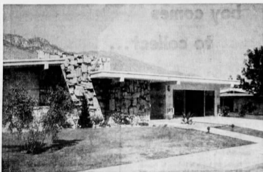
TYPICAL CONDOMINIUM — This is but one of many designs in condominiums now offered at Canyon Estates. Currently it is being used for "open house"