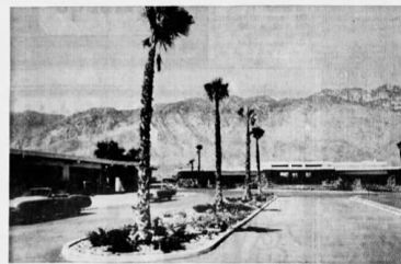
MAIN ENTRANCE — This is the view seen by all who are fortunate enough to be in or visit Canyon Estates. The resident's clubhouse, which is equal to a full-